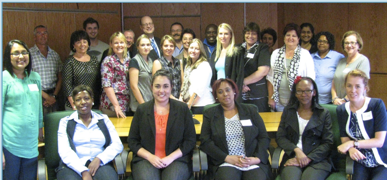
Participants ( Pharmacists and Post Basic Pharmacist Assistants) with the Practice Analysis Leaders.

As the first institution to be accredited for presentation of the Pharmacy Technical Assistant (Higher Certificate) and Pharmacy Technician (Advanced Certificate) qualifications NMMU is actively involved in ensuring that the programmes we present answer the needs of the workplace. On 31 March 2014 a practice analysis was, therefore, undertaken for the Pharmacy Technician. The practice analysis was undertaken by the Pharmacy Department at NMMU in association with the St Louis College of Pharmacy, USA.