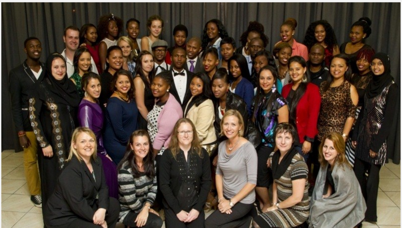
The graduating class along with the Pharmacy staff who supported and lectured them in 2013

This year the Pharmacy Department celebrated the first ever graduation of Pharmacy Technical Assistants in South Africa. A graduation dinner and award ceremony was held for the graduating class on the 16 th April 2014 at the North Campus conference centre. The evening was made possible through funding from the US President's Emergency Plan for AIDS Relief (PEPFAR) and CDC/South Africa, managed by the American International Health Alliance's HIV/AIDS Twinning Center. (See more photos on page 7)