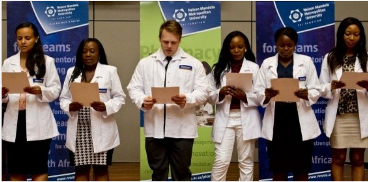
The Pharmacy Department hosted the annual Pharmacist Oath Ceremony on the 13th April 2014 in the South Campus Auditorium. The Pharmacy graduates proudly pledged the Pharmacist Oath in English or isiXhosa.